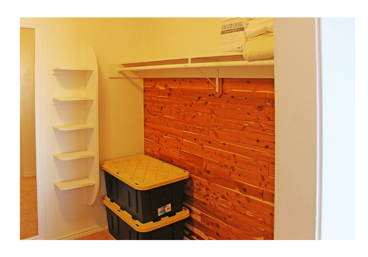
Huge Walk-in Closet