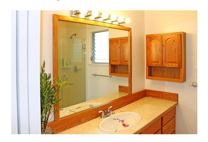
Spacious Master Bath