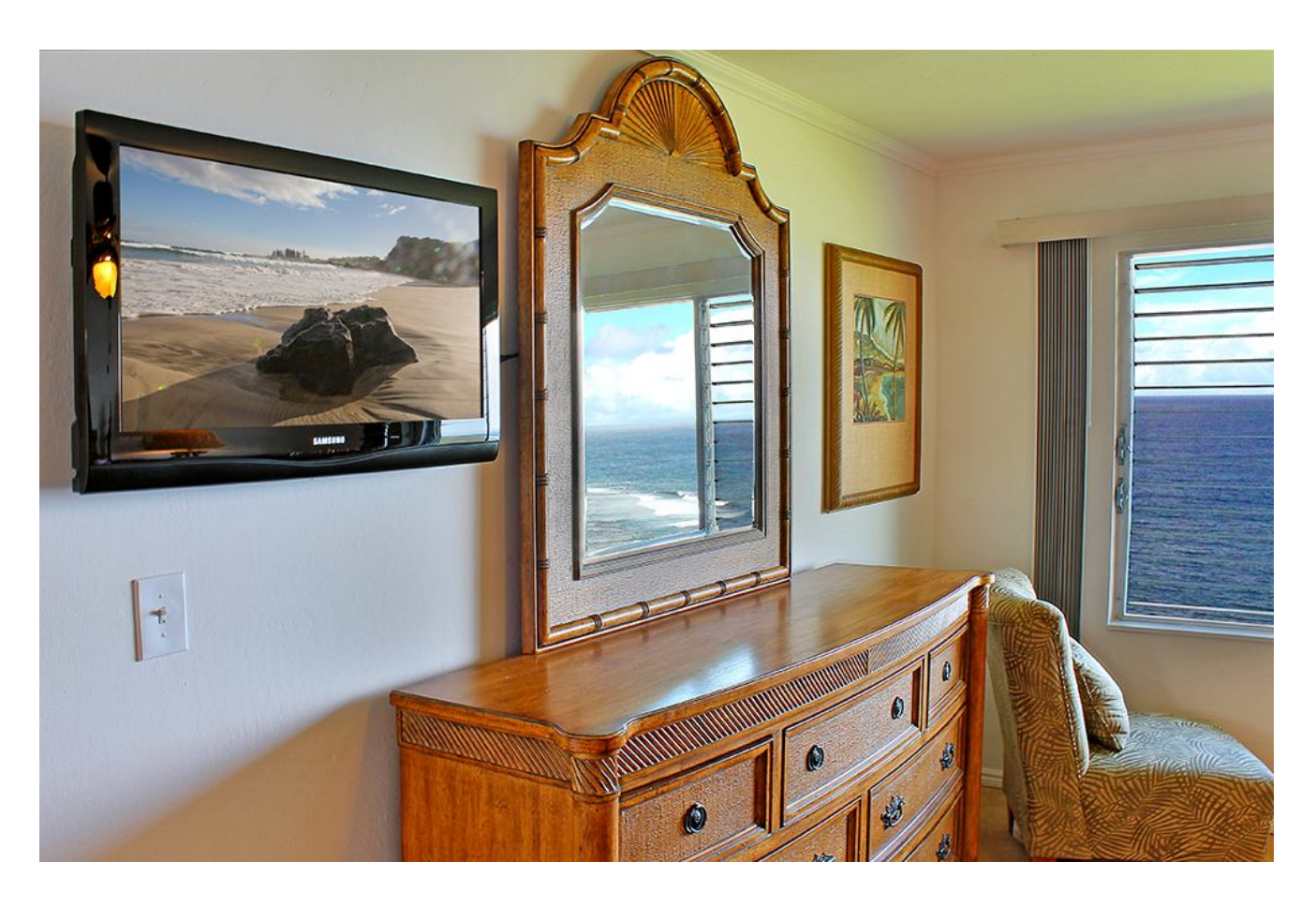
Tommy Bahama Tropical Bedroom Set