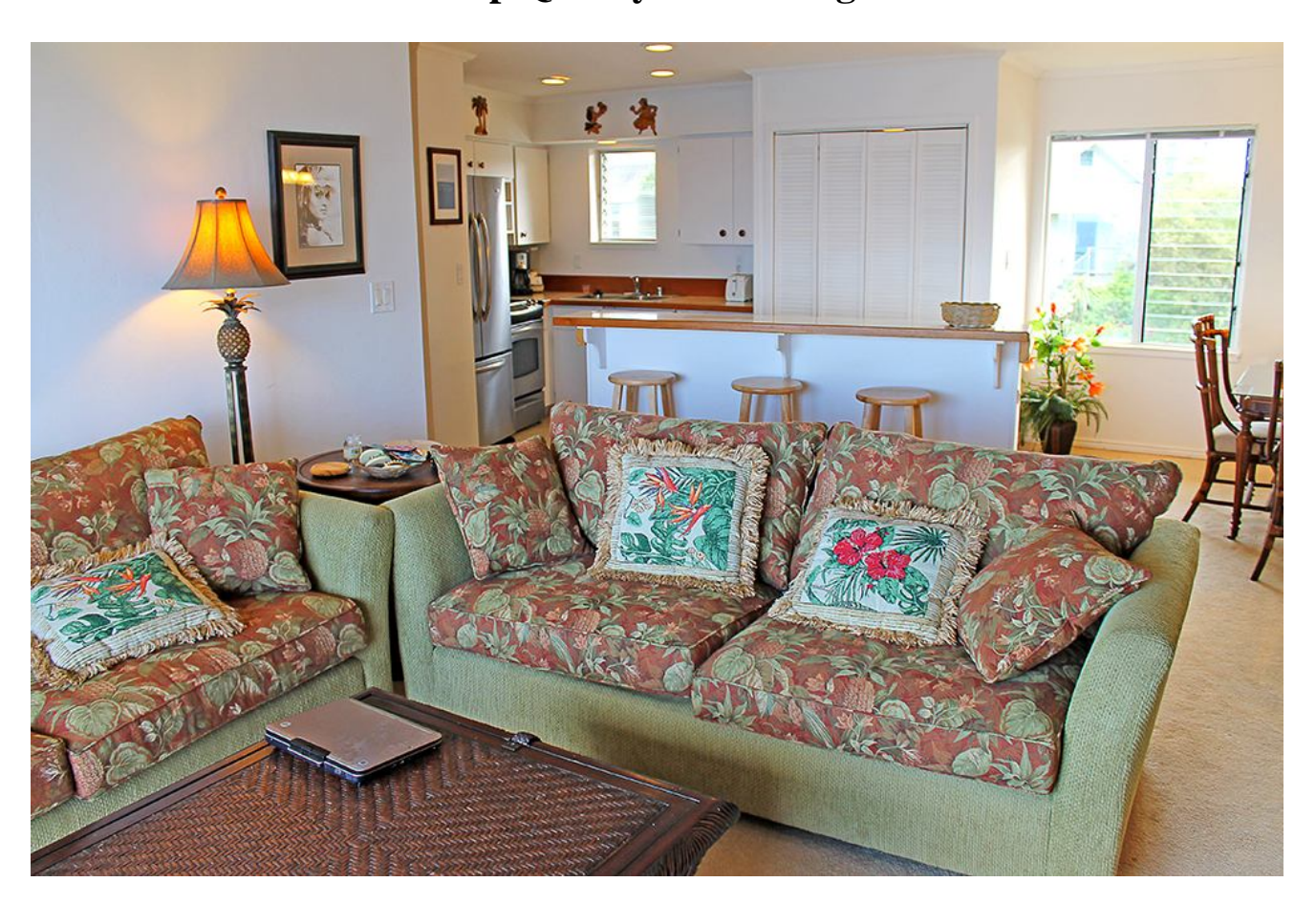
Tommy Bahama Entertainment Center