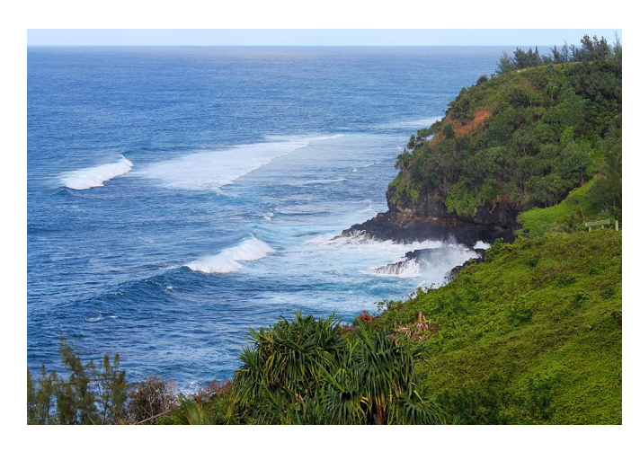
Ku Lani – Standing in Heaven – Gorgeous – View from Lanai

To Reserve, Call: (970) 223-1349 (Colorado, USA) Toll Free: 1-888-431-9406