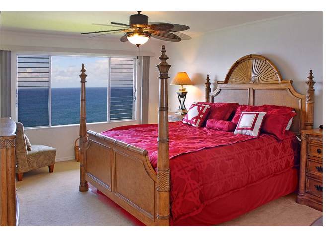
For a full set of photos, scroll to the bottom of this document